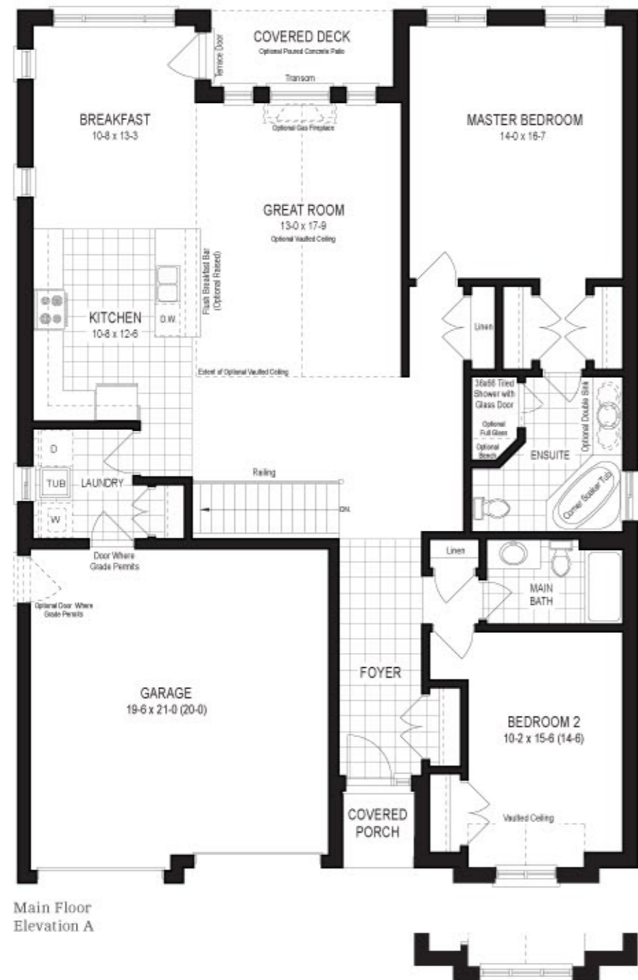
Main Floor Elevation A